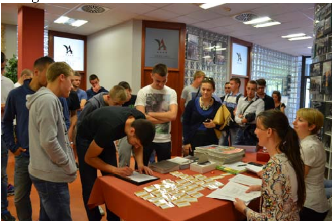
A group of younger delegates at registration.