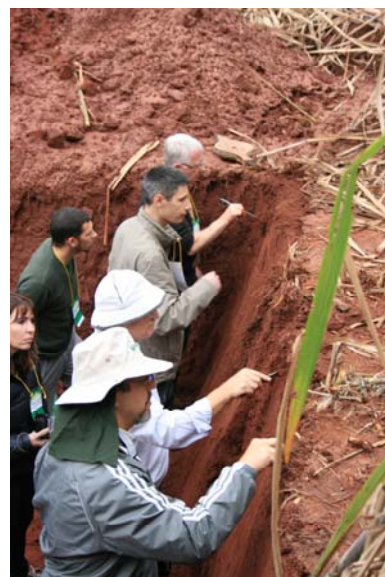
Line up for inspection