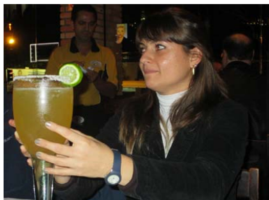
Welcome drink to share