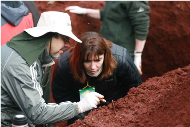
On close inspection