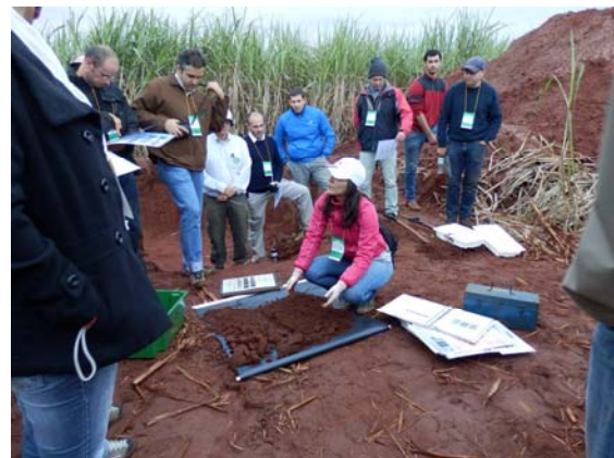
Methods explained at the surface