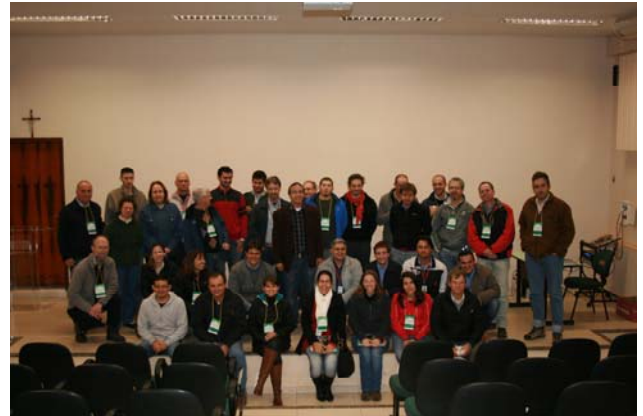
Delegates at the discussion sessions.